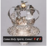
Come Holy Spirit, Come!

invite everyone to pray the Rosary with them in their home, every evening at 7:00pm, at 42 Alderton St, Leamington, Sun, May 21 -25, 2023. Wed evening, we will pray in English. Friday, May 26 evening prayers will be at the Portuguese Club, 7pm. On Sun, May 28 The Feast of Pentecost Holy Mass will be celebrated at 12pm, at St. Michael's Church followed by Procession to the Portuguese Club & Lunch. ALL ARE WELCOME!